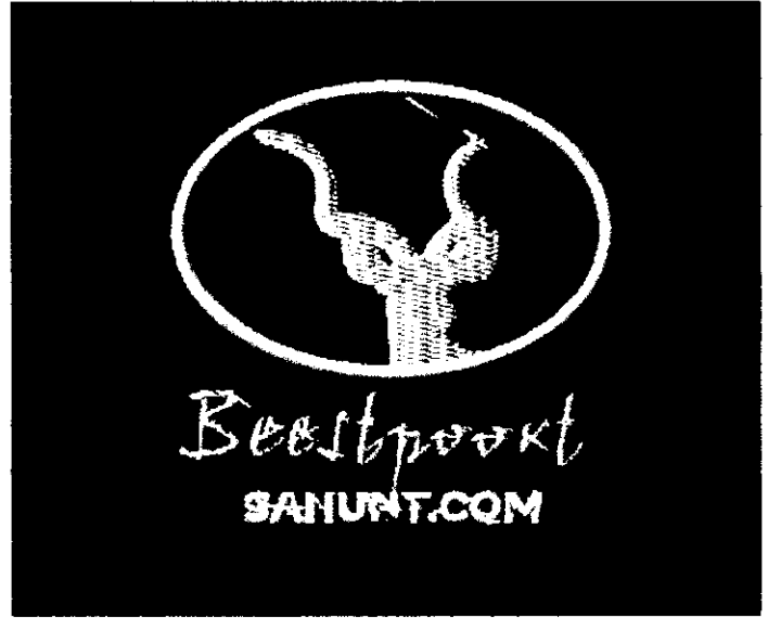
Artwork Size: 66mm (W) x 66mm (H)